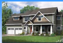
Family owned and operated Since 1972