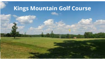
307 Kings Mountain Road-Rockwood, PA 15557 (814) 926-2021

Receive the title of the official sponsor of this year's MLCC Annual Golf Outing in all press & media coverage! Includes: Tournament entry for a foursome, food, refreshments, a full page back, inside front, or inside color ad in the event program, and prominent recognition on the leader board.