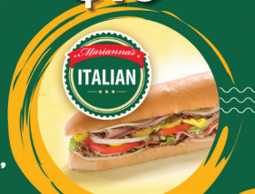
14" Italian Hoagie

Donegal Event Center, Off Route 711 near Stahlstown Fire Station, & Off Route 31